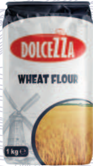
WHEAT FLOUR 1 KG