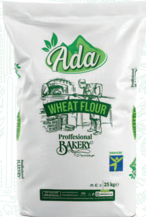
WHEAT FLOUR 25 KG