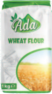
WHEAT FLOUR 1KG