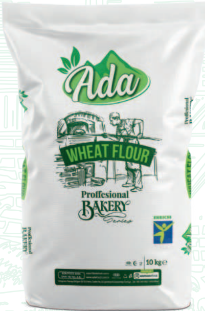
WHEAT FLOUR 10 KG