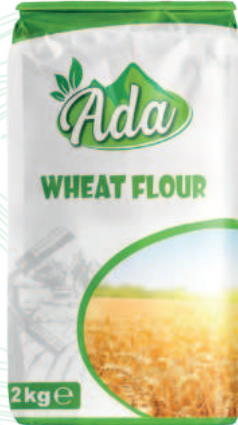
WHEAT FLOUR 2 KG