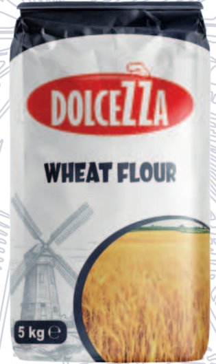
WHEAT FLOUR 5 KG