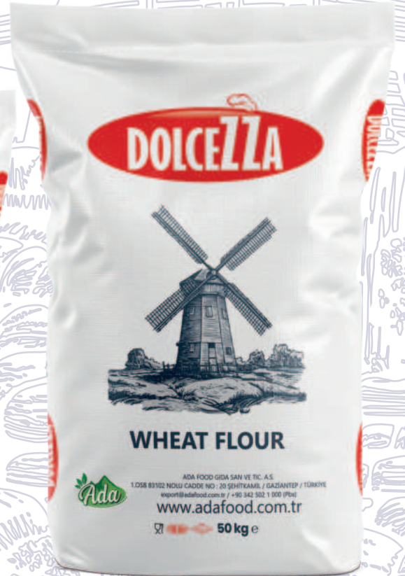
WHEAT FLOUR 50 KG