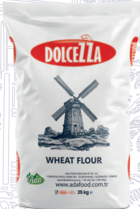
WHEAT FLOUR 25 KG