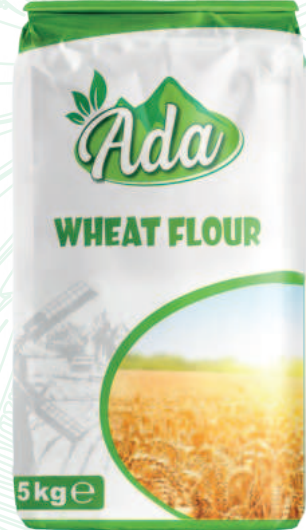
WHEAT FLOUR 5 KG