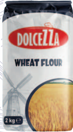
WHEAT FLOUR 2 KG