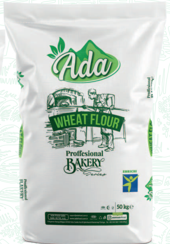
WHEAT FLOUR 50 KG